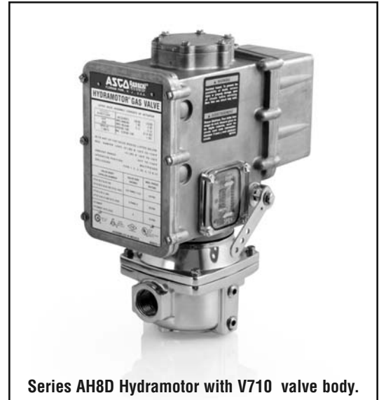
Series AH8D Hydramotor with V710 valve body.

One SPST relay; field adjustable to actuate at any position of stroke is standard. Max. load is 2.5A@120V or 1.25A@240V is standard.